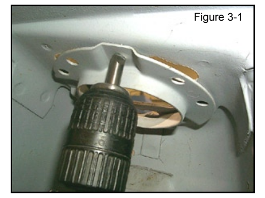
Figure 3-1 applies only to vehicles using carraige bolts to secure the factory upper shock mount.

Note: Fairlane shock towers use a slightly different bolt pattern and must be drilled to match the adapter and backup plates. Structural integrity is maintained through use of the backup plate.