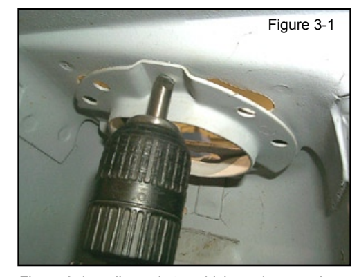
Figure 3-1 applies only to vehicles using carraige bolts to secure the factory upper shock mount.

Note: Fairlane shock towers use a slightly different bolt pattern and must be drilled to match the adapter and backup plates. Structural integrity is maintained through use of the backup plate.