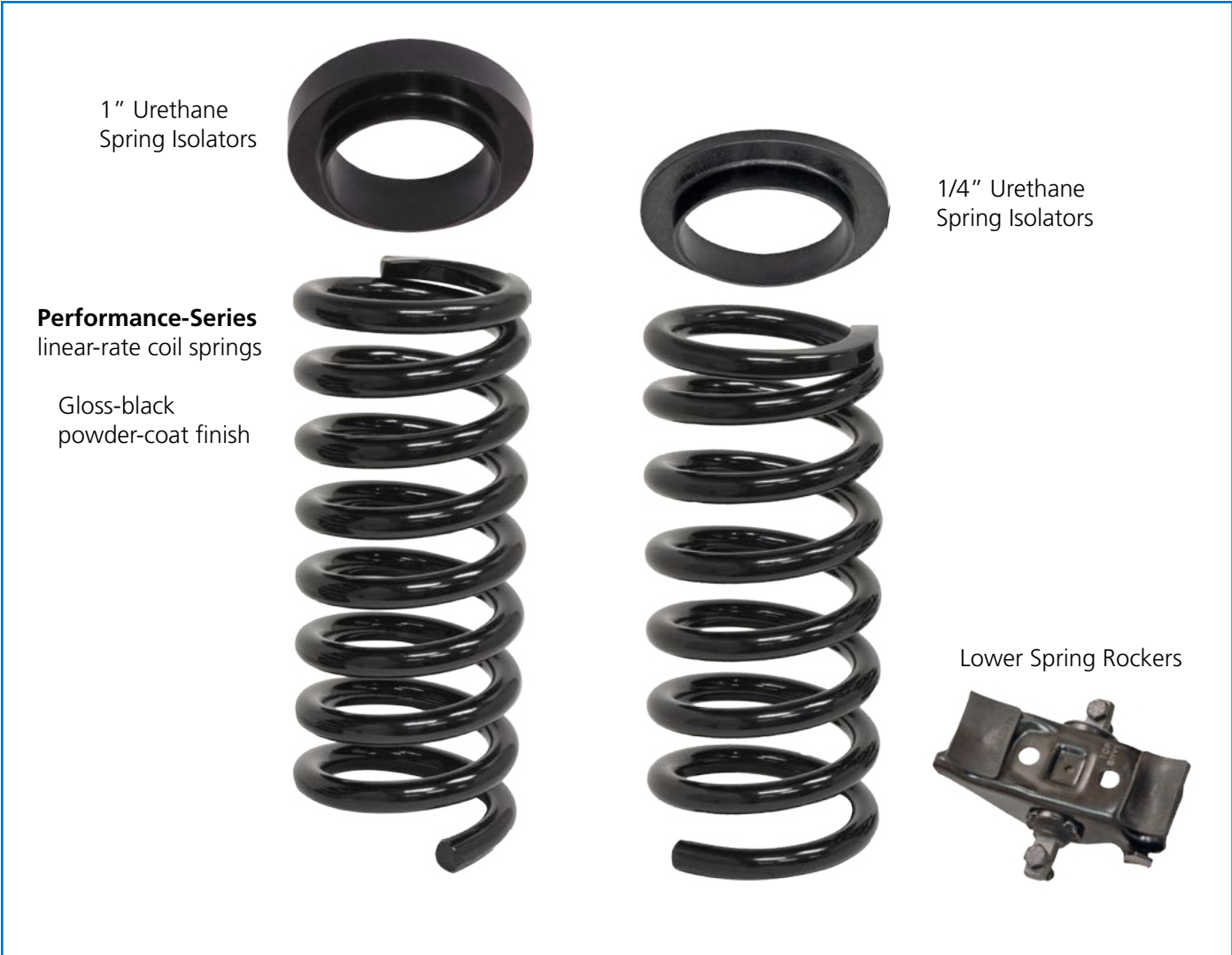
1" Urethane Spring Isolators