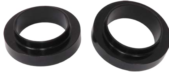
TCP SVM1-03 (above) - 1" thick spring isolators, black urethane, raises ride height approximately 1-1/4"