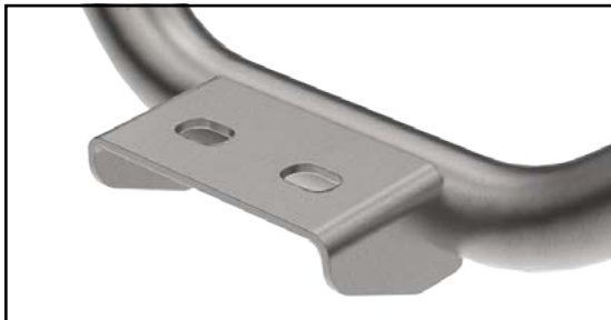
Crossmember bracket fits GM-style aftermarket urethane mounts.