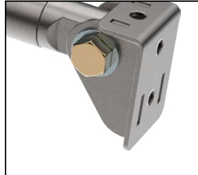
Weld-on frame brackets (2-3/4" tall) match Mustang and Nova rail height. Must be trimmed for shorter rail height of Falcons.